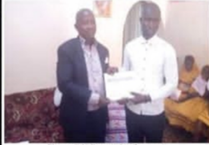
Picture of the Presentation Ceremony