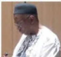
Chief Justice delivering his keynote statement during the book launch provide context-specific understanding of the past, present and future effects of constitution-making and evidence-based local realities. The book also traverses some of the enduring and emerging constitutional issues that the Gambia has grappled with.